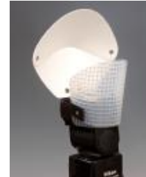
(optional) front diffuser sticks on with Velcro tabs