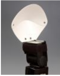
The Saucer on the flash

For all hot-shoe flashes * 1.25 ounces * Pop the top to form the 'dish' * No-glue stretch band