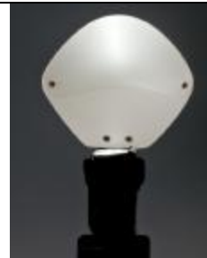
Ceiling situations, or non ceiling close-ups: Set the Saucer back to skim the top only.