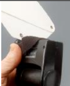
Center the Saucer on your flash with your left hand