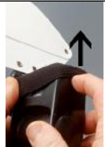
To remove, flick the front of the strap up.

If the strap is too tight or loose, remove the strap and change the start position on the hook Velcro section.