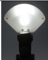
Non-ceiling situations, medium distance: Set the Saucer forward.