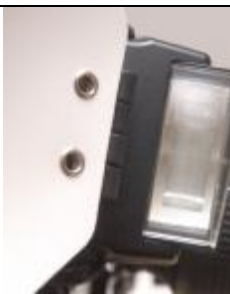
For use on the Nikon SB400 flash, 1/4" spacing from the flash lens.