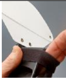
Pull forward and over the front of the flash.