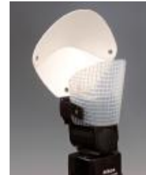
(optional) front diffuser sticks on with Velcro tabs