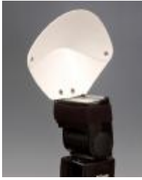
The Saucer on the flash

For all hot-shoe flashes * 1.25 ounces * Pop the top to form the 'dish' * No-glue stretch band