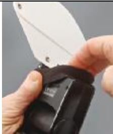
Grasp the front of the stretch strap with the fingers of your right hand.